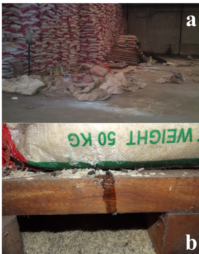
Figure 2. Images de l'intérieur des entrepôts du Port Autonome de Cotonou avec (a) des piles de sacs de riz, (b) du riz jonchant le sol et des fèces et de l'urine de rongeurs — Pictures of inside Cotonou seaport storehouses showing (a) rice bags piles, (b) wasted rice on the floor as well as rodent urine and feces.