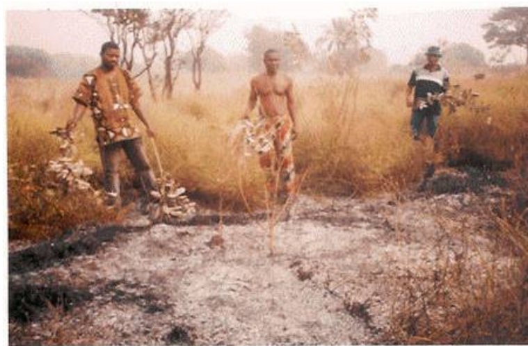
Fig. 7: Late burn of Aeschynomene histrix biomass in dry period at Ouessè (Central Benin)

The practice of fire wall and fire of reference around the plot is necessary to avoid the burn of the mulch in dry period