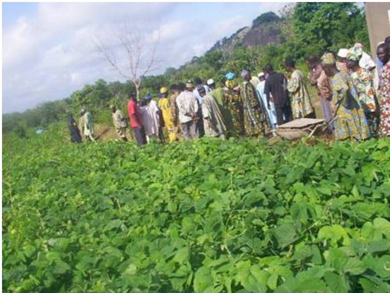
Fig. 4: Focus group at village level on the preceding Mucuna pruriens var utilis and maize for yam production (Dassa-Zoumè in central Benin)