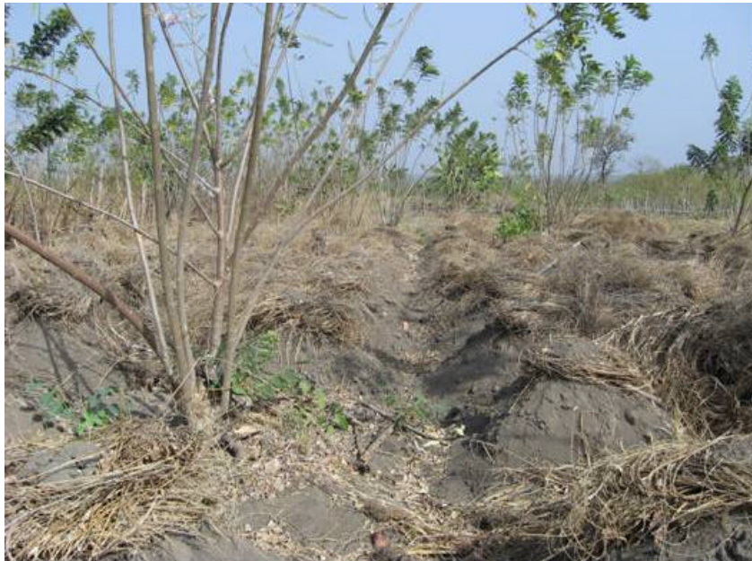
Fig. 6: Three-quarters of Aeschynomene histrix biomass manually incorporated into the soil in October-November during ridging and the remaining quarter left on the surface as mulch in order to reduce the workload related to the biomass incorporation in the soil (Central Benin)

The study highlights on farm research with yam-based cropping systems. Participatory diagnosis evaluates constraints degree of severity of yam-based systems with herbaceous legumes. As a whole, the herbaceous legumes gave satisfaction for the problem of soil fertility. Mucuna in particular was appreciated for its capacity to restore the soil fertility, to maintain soil humidity and to control weeds as well as in low and