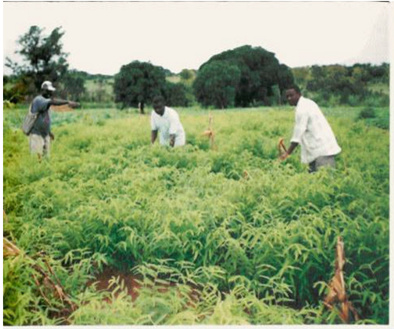
Fig. 3: Preceding Aeschynomene histrix and maize for yam production at Ouessè (Central Benin)