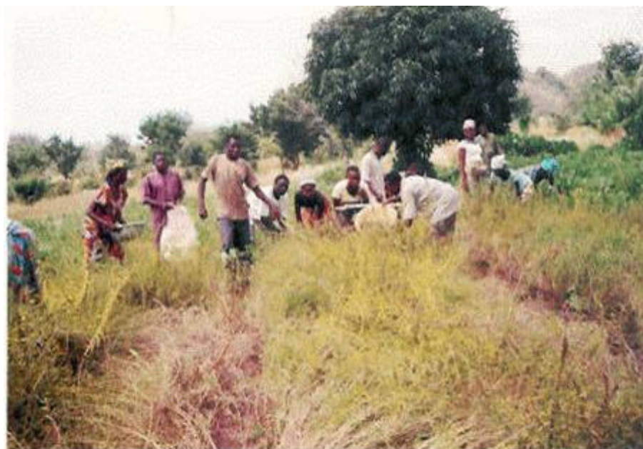
Fig. 8: Seed production plot: Aeschynomene histrix seeds harvesting at Dassa-Zoumè (Central Benin)

On the seed production plot, the biomass of Aeschynomene at senescence is shaken within basins to collect easily the seeds