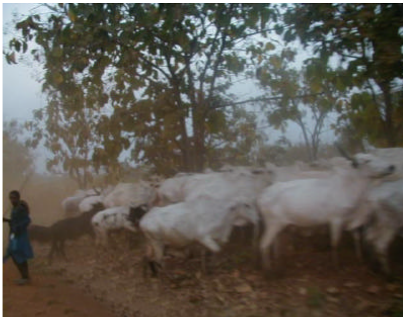
Fig. 5: Animal divagation contributing to crops damage and herbaceous biomass remove (Ouessè in central Benin)

Mineral fertilizer application appeared to be essential particularly in ZA, but the high cost of inputs limits their application. Smallholders use fertilizers on maize on depleted soils depending on cash and inputs availability. Consumers' requirements for the quality of taste often slowed down the direct application of chemical fertilizers on yam because of their "presumed negative effect" on the quality of pounded yam [7]. For this reason, farmers avoid applying mineral fertilizers during the yam